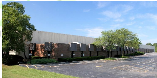
A view of our Carol Stream, IL. Facility

At Carol Stream IL., COM2 owns and operates a sizeable facility that is spread over approximately 12.5 Acres of Land. Since 2001, it is a technologically advance recycling powerhouse that is fully monitored secured 24/7, 365 days a year.