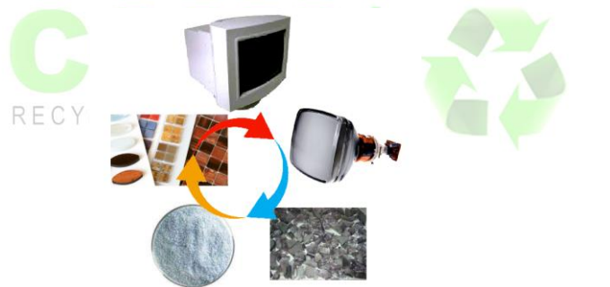
Figure Com2 - Processing of Glass into Frit

We Separate, Clean & blend our Glass with right ingredients required processing it into “FRIT”, which is used for the manufacturing of Ceramic Tiles. Thus, providing the tile industry with the required raw materials while helping the organic growth of the economy.