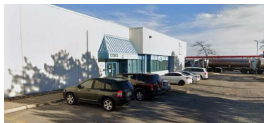
A View of our Canadian Facility

Com2's Canadian facility greatly extends our service capability. The Canadian counterparts iced up the R2 Certification awarded in Canada. We are also proud to be ISO 9001, ISO 14001, and ISO45001 Certified. Our Canadian facility accentuates the prolific contribution of COM2 in the handling of huge ewaste across North America.